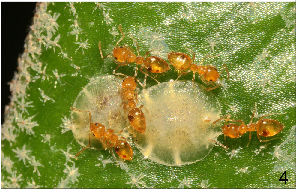
Figs. 3–4. Plagiolepis alluaudi EMERY, 1894. 3 – head. 4 – workers at the leaves of the fern Platyserium bifurcatum (Cav.) C. CHR., with visible scale bug (Diaspididae) infestation.