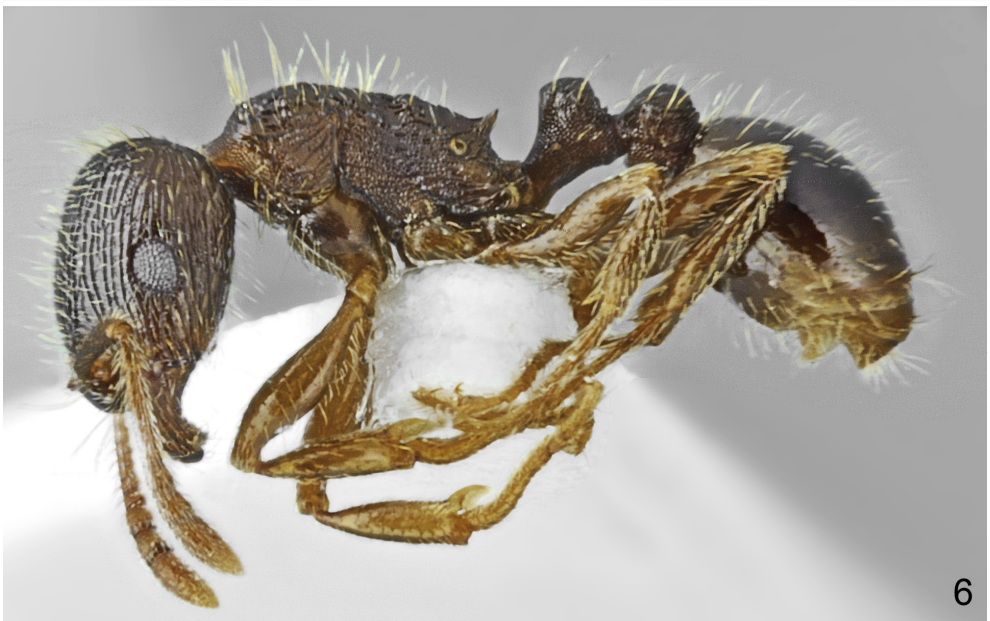
Figs. 5–6. Tetramorium indocile SANTSCHI, worker: 5. dorsal; 6. lateral.