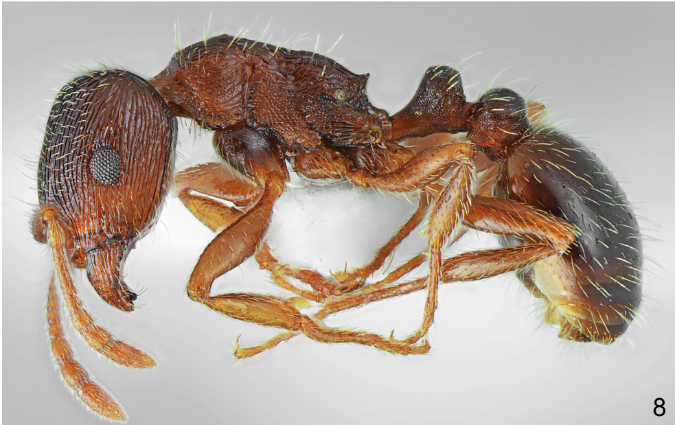
Figs. 7–8. Tetramorium staerckeii KRATOCHVIL, worker: 7. dorsal; 8. lateral.