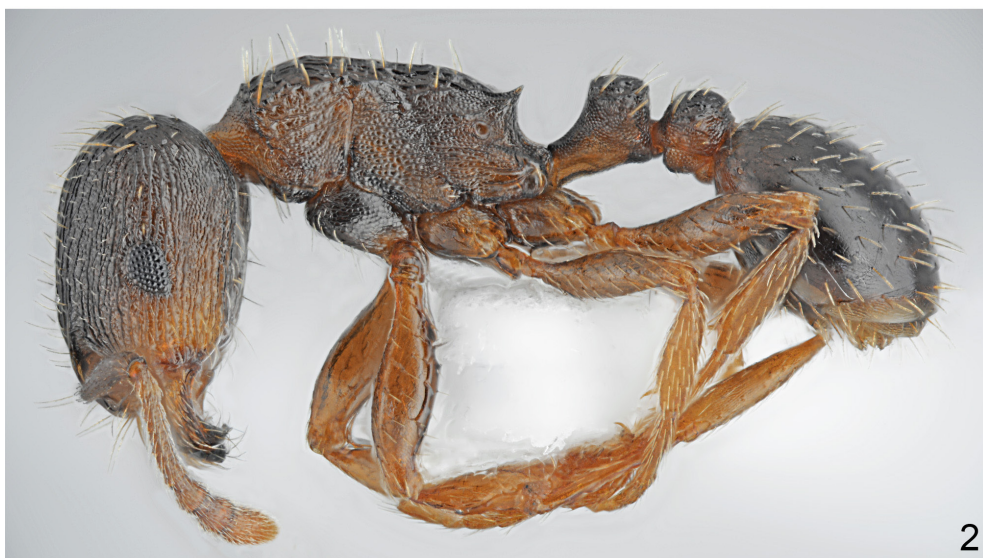
Figs. 1–2. Tetramorium rhodium EMERY, worker: 1. dorsal; 2. lateral.