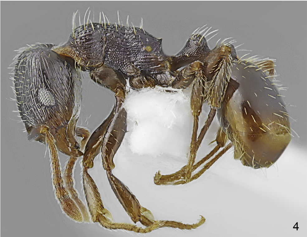
Figs. 3–4. Tetramorium sulcinode SANTSCHI, worker: 3. dorsal; 4. lateral.