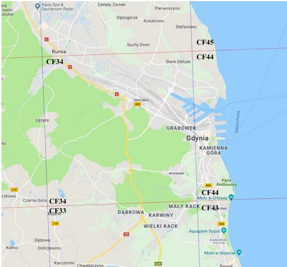
Fig. 1. Map showing the position of UTM (Universal Transverse Mercator) squares in Gdynia (based on a map downloaded from http://lepidoptera.eu/records2/Map.php on 30.01.2017).