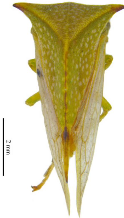
Fig. 3. Habitus of Stictocephala bisonia , dorsal view – male from Pilchowice (collected on 28 August 2013), leg. and det. Ł. Junkiert.

Sosnowiec, Zagórze, a vicinity of Kielecka Street [50°17'21"N, 19°10'46"E; CA77], urban greenery: 13.08.2016, 1♂, leg. M. Walczak;