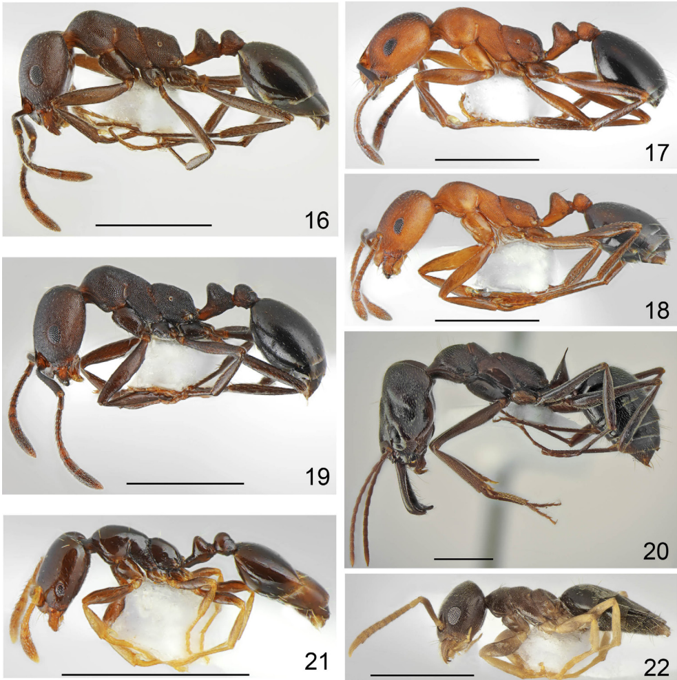
Figs 16–22. Worker of Monomorium afrum (16); Worker of Monomorium bicolor (17); Worker of Monomorium cf. salomonis (18); Worker of Monomorium cf. opacum (19); Worker of Odontomachus troglodytes (20); Worker of Monomorium rosae (21); Worker of Technomyrmex pallipes (22) (scale bar = 1 mm).