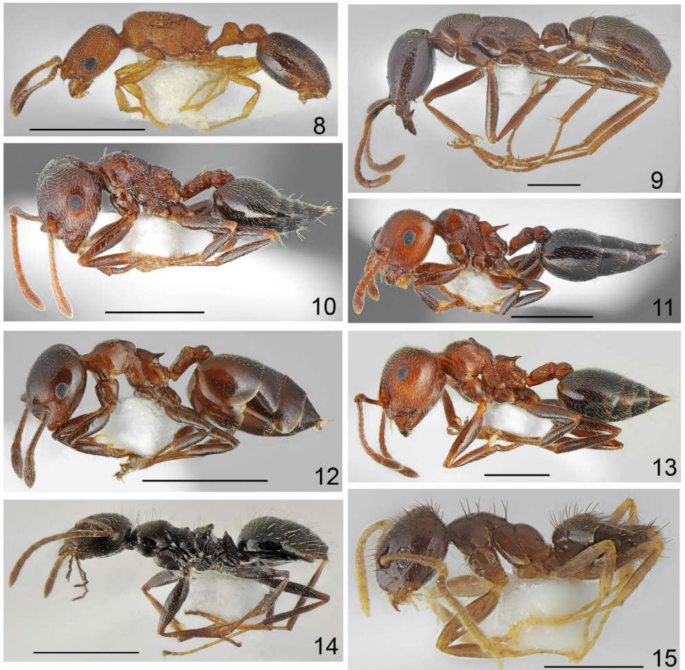
Figs 8–15. Gyne of Cardiocondyla emeryi (8); Medium worker of Dorylus nigricans burmeisteri (9); Worker of Crematogaster cf. aegyptiaca (10); Worker of Crematogaster cf. excisa (11); Worker of Crematogaster cf. gambiensis (12); Worker of Crematogaster senegalensis (13); Worker of Lepisiota canescens (14); Worker of Nylanderia jaegerskioeldi (15) (scale bar = 1 mm).