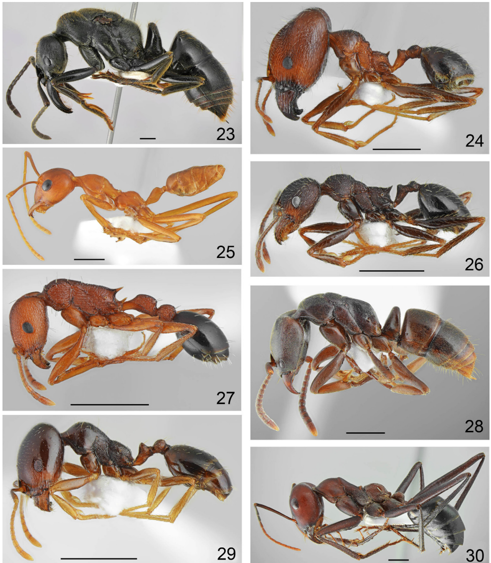
Figs 23–30. Gyne of Paltothyreus tarsatus (23); 24. Major worker of Pheidole rugaticeps (24); Major worker of Oecophylla longinoda (25); Minor worker of Pheidole welgelegenensis (26); Worker of Tetramorium sericeiventre (27); 28. Worker of Mesoponera escherichi (28); Medium worker of Trichomyrmex abyssinicus (29); Worker of Cataglyphis cf. oasium (30) (scale bar = 1 mm).

Accepted: 25 March 2018; published: 8 May 2018